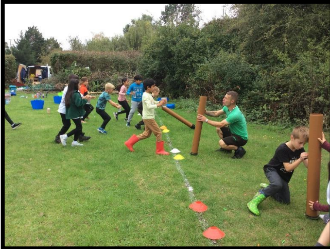
Children in Oak having a great time and hopefully not getting too wet!

The beautiful autumn weather that we have been having has really enhanced the fun children have had at their team building sessions. The sessions are designed to get our newly mixed classes working together, collaborating and getting to know each other. All of this will have a positive impact in the classroom.