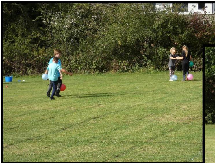
Children from Spruce enjoying their turn.